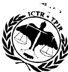
[Seal of the Tribunal]

Done this 29 th day of October 2010, At The Hague, The Netherlands.